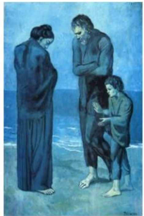
Pablo Picasso The Tragedy, 1903. Oil painting on canvas.