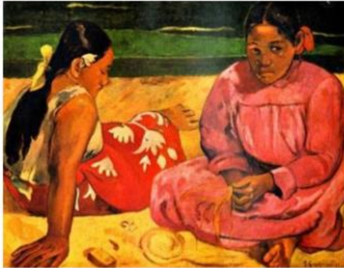
Paul Gauguin Tahitian Women on the Beach, 1891. Oil painting on canvas.