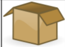
as in box