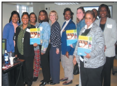
Enterprise version of Accelerated Reader.

Richland One students and teachers now have the opportunity to take their reading practice and enrichment activities to another level. All district schools now have access to the Renaissance Place